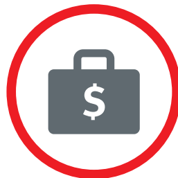
Amending the investment law