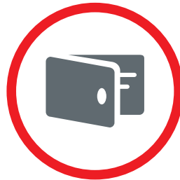
Cuts in fuel subsidies