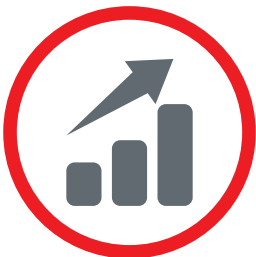
Increasing interest rates